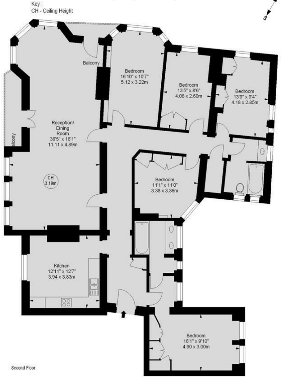
Illustration For Identification Purposes Only. Not To Scale *Floorplan Drawn According To RICS Guidelines

Approximate gross internal area 1,905 sq ft / 176.97 sq m